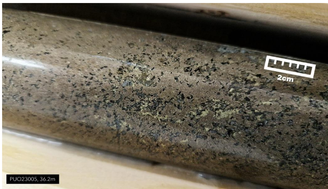
Figure 1: Photograph showing massive sulphide mineralisation (pyrrhotite, chalcopyrite) in drillhole PUO23006, 36.2m.

Drillholes PUO23006 and PUO23010 have subsequently been surveyed with DHEM with final models and results still pending. Preliminary modelling has shown no significant off-hole conductors although the response in PUO2310 was reportedly complex.