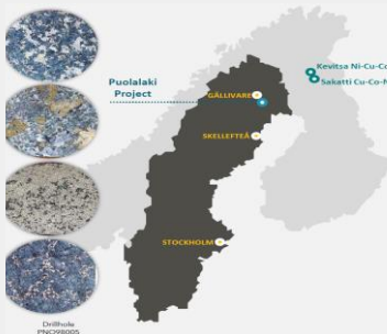
Puolalaki Project location, Sweden

968,710,000 Quoted options exercisable (AVWOA) at $0.008 on or before 31 December 2024