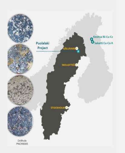
Puolalaki Project location, Sweden

968,710,000 Quoted options exercisable ( AVWOA ) at $0.008 on or before 31 December 2024