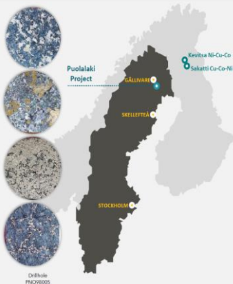
Puolalaki Project location, Sweden

968,710,000 Quoted options exercisable (AVWOA) at $0.008 on or before 31 December 2024