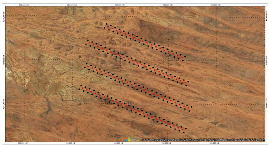
Figure 4: MLTEM Surveying completed at the Mt McPherson project.

All data was acquired with a SMARTem24 instrument combined with an DRTX transmitter and a SMARTcoil sensor working at a low base frequency of 1Hz (250ms time base).