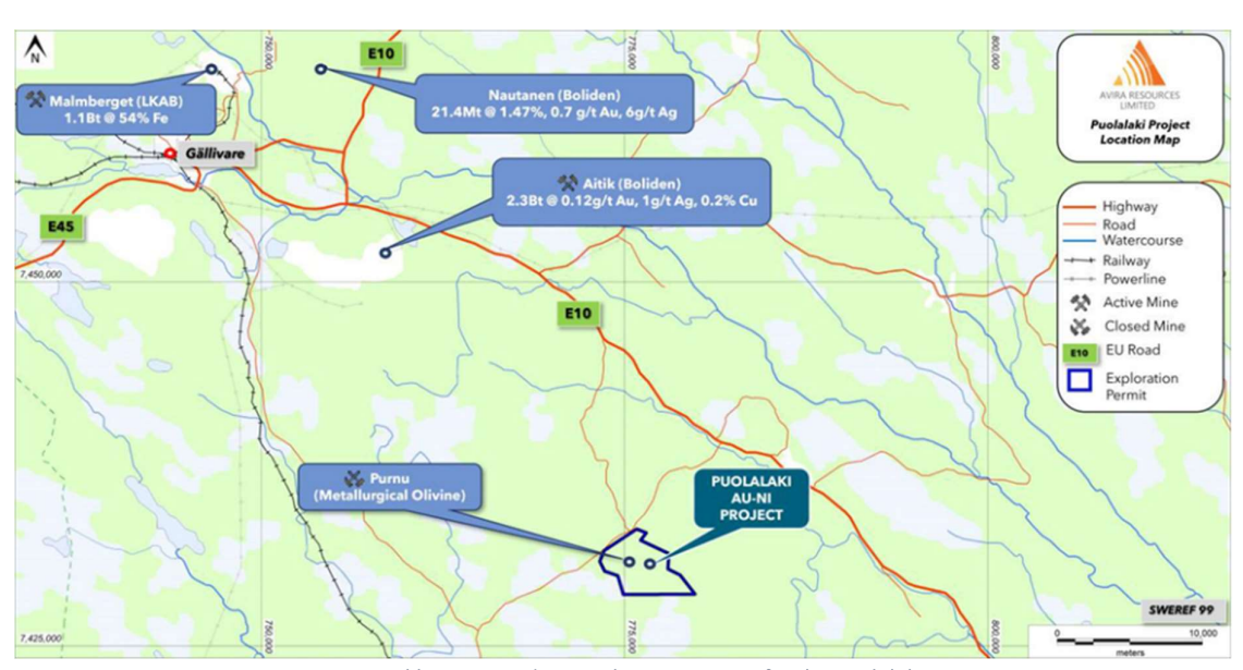
Figure 2: Regional location and mineralisation setting for the Puolalaki Project

In addition to the Ni-Cu mineralisation at Puolalaki, the project also contains significant, high-grade gold (± Cu, W, Mo) mineralisation. The bulk of the historic exploration at Puolalaki was focused on the gold mineralisation that was first discovered by LKAB during the 1980's whilst exploring for metallurgical olivine within the Puolalaki gabbro.