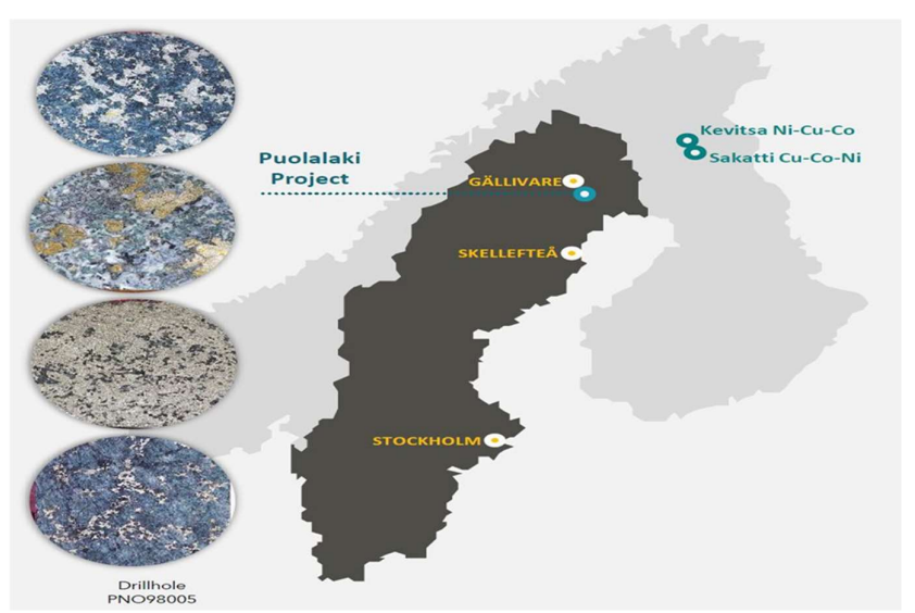
Figure 1: Puolalaki Project location and images showing Ni-Cu mineralisation from project drill-core.

At Puolalaki, (50km SE of Gällivare) Ni-Cu mineralisation is hosted in a syn-orogenic gabbro intrusion that displays evidence of fractional crystallisation and segregation of the mafic melt. Blebby euhedral magmatic sulphide textures are evident in drillholes PNO98004 and PNO98005. In 1998, exploration company North Atlantic Natural Resources (NAN) drilled two holes intercepting magmatic sulphides at Puolalaki effectively confirming the occurrence of Ni-Cu-Co mineralisation within the gabbro intrusion, significant intercepts included: