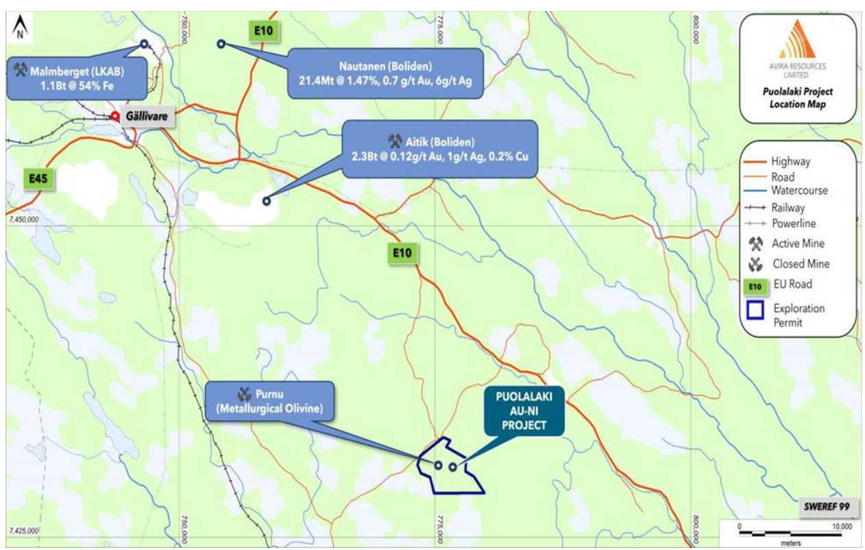
Figure 1: Regional location and mineralisation setting for the Swedish based Puolalaki Project.

Avira Resources Limited (ASX: AVW ) ( Avira or the Company ) is pleased to announce that the planned exploration program for the twin system CU-CO-NI and AU is scheduled to commence in November 2022. This campaign includes exploration Stages 1 and 2 consisting of Airborne Magnetic, Fixed-loop EM Surveys and Diamond Core Drilling.