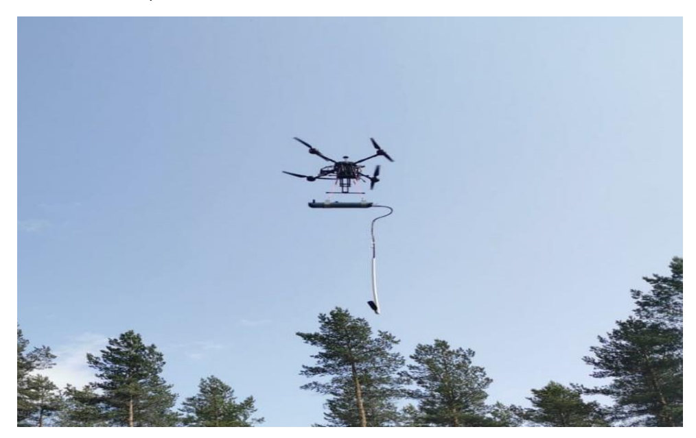
Figure 3: Image of Drone MAG system

The UAV will fly according to planned flight path and follow terrain keeping nominal flight altitude at 25 - 30 meters, if allowed by trees a 20m flight may be used, but it will be verified on site. Raw Data will be delivered to the client on daily basis or as agreed. Final processed data will be delivered within three weeks after the survey is finished.