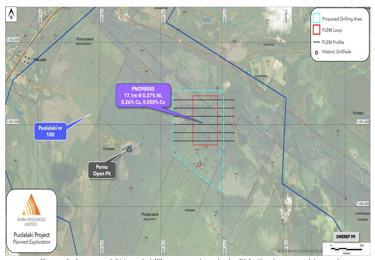
Figure 2: Proposed EM and drilling areas located within the tenement boundary.

Avira currently intends to carry out exploration work in the form of air and ground based geophysical and diamond core drilling within the permit area. The surveys are part of the Company's work to explore the bedrock in the area. The work will take place within the work area plotted on the map of this work plan shown in Figure 2 below.